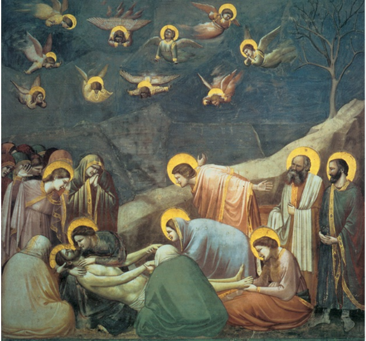
Lamentation of Christ. In The Lamentation of Christ, also by Giotto, Jesus' family and disciples receive his body after it has been removed from the cross.